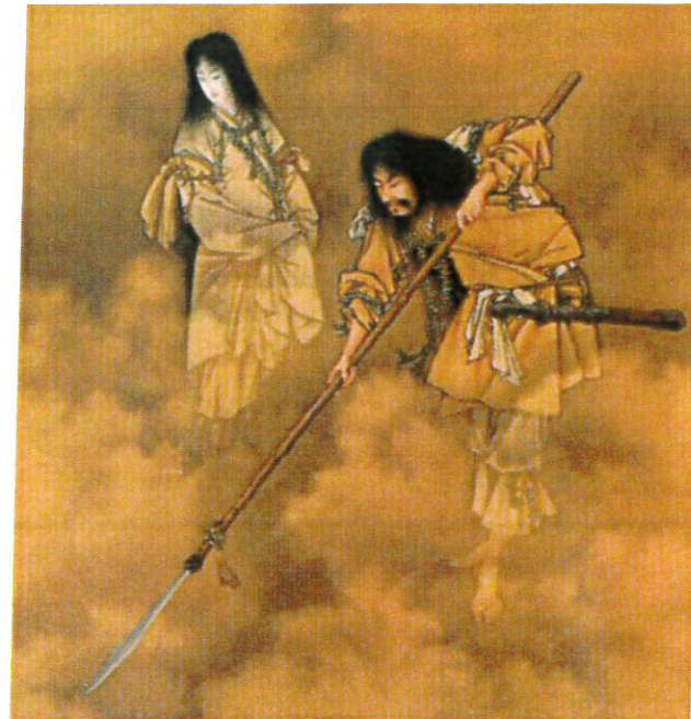
JAPANESE CREATION STORY linked to lost city. Was Atlantis just a mistake? New evidence found by local woman.

Note: The goddess, not the terrorist organization.